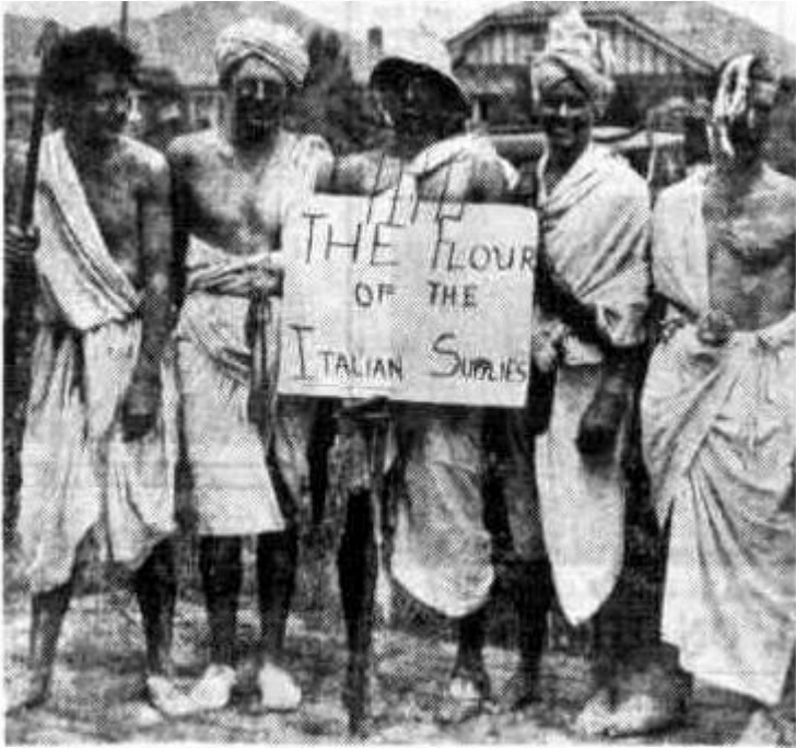
Another angle on the Italian situation in Africa. These students spent a lot of time on their make-up, which consisted of anything which might make them black.